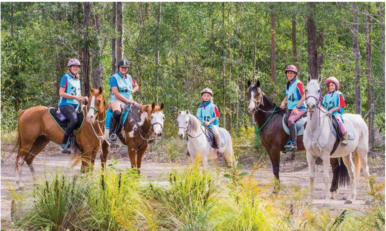
Riders in the 20km on Saturday.