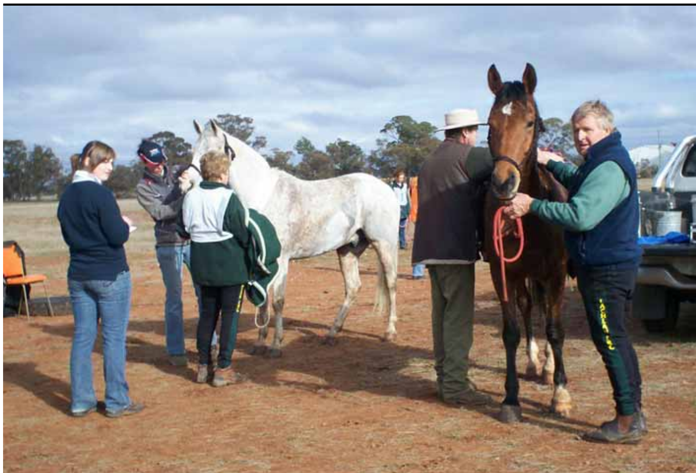
Coolamon