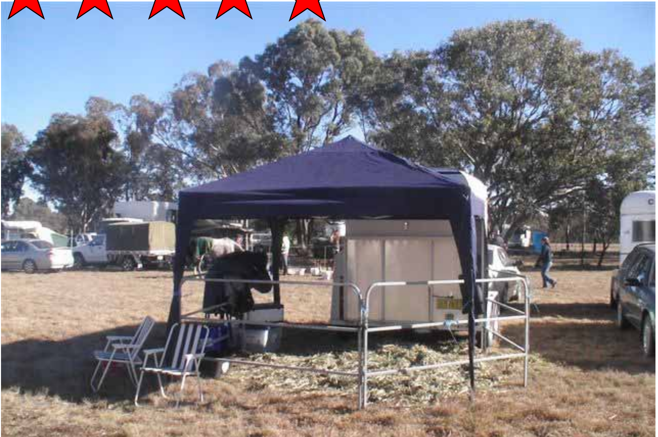
Photo taken at Mudgee Endurance Ride.

Is this the way things are heading? Goosenecks with all the mod cons and now horses with their own individual portable stables?