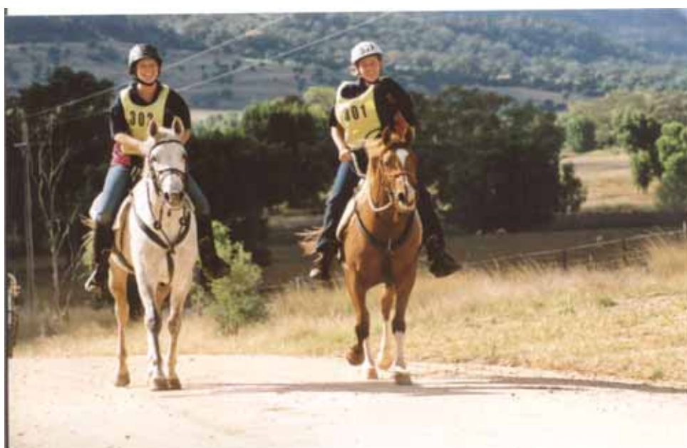
Riders enjoying the Tooraweenah Endurance Ride.

The first time I had to have a horse put down was in traumatic circumstances after an accident and I was so upset I considered not owning a horse again. After much thought, I decided what counts in the old measurement of the scales. Yes, it is very distressing when they die, but against that you have to weigh up all the pleasure and joy that they bring you and that always wins out.