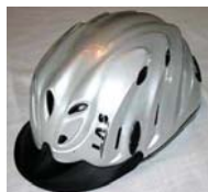
LAS HELMET. COLOURS: SILVER & RED