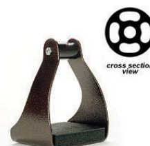
EZ RIDE STIRRUPS SHOCK ABSORBANT TOP BAR