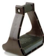
EZ RIDE NYLON STIRRUP