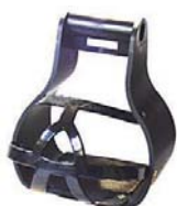
FLEX RIDE CAGE STIRRUPS IMPORT SCOTLAND