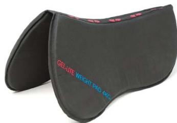
NEW ZILCO WEIGHTED GEL PADS 4KG & 10KG

IMPORT ITALY. COLOURS, BLACK, ROYAL BLUE & OLIVE GREEN