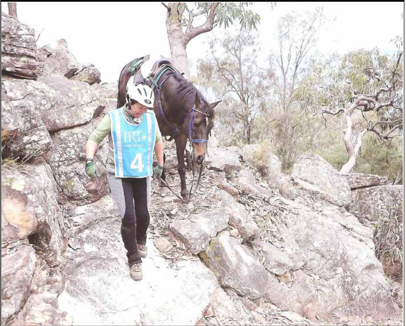
At the Shahzada on the "Steps" 'Are you serious, where's the grass?'

by the number of times we have parted company when he shies. Never mind, it's not as bad as falling off a warmblood. On the ground he can be grumpy, especially when being groomed or fussed over, much to the alarm of ride vets.