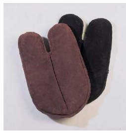
NEW SUEDE SEAT SAVER IMPORTED UK