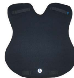
WEIGHTED GEL PAD AVAILABLE IN 4KG, 6KG, 8KG, 10KG & 12KG Smaller Weights Coming Soon