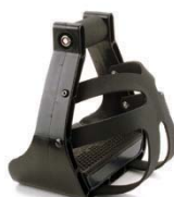
EZ RIDE NYLON CAGED STIRRUP