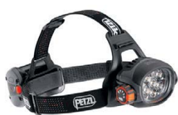
NEW ULTRA PETZL HEADLAMP

STIRRUPS USA IMPORT - COLOURS BLACK OR BROWN