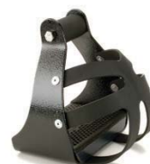
EZ RIDE ALUMINIUM CAGED STIRRUP