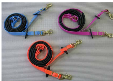
NEW ZILCO FLURO RANGE. Colours - Orange, Cerise Pink & Cyan Blue. available in the Deluxe Breastplate, Deluxe Endurance Reins, Marathon Bridle & Rings