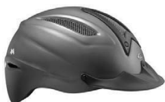
NEW XT ENDURANCE HELMET