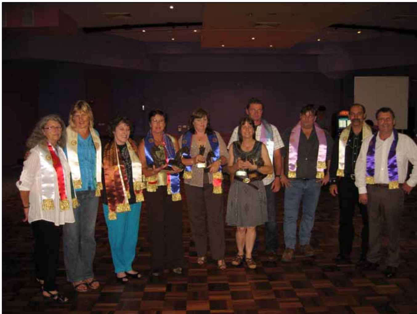
Group photo from the AGM.