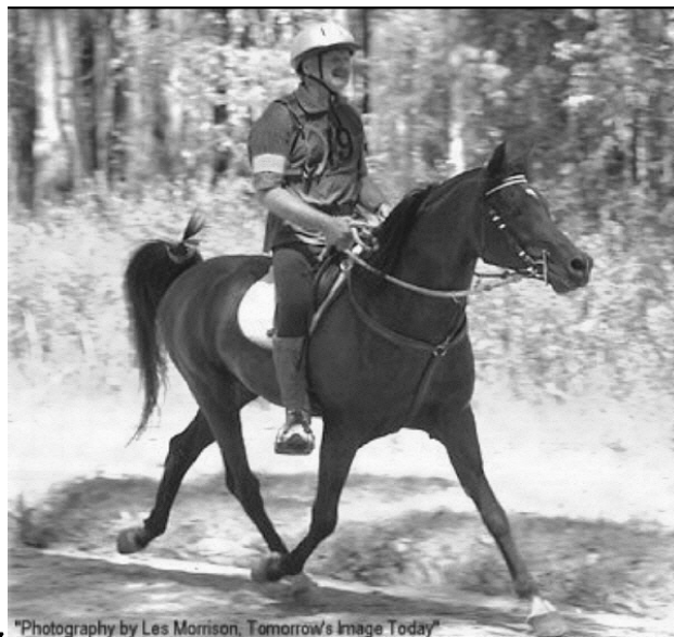
"Photography by Les Morrison. Tomorrow's Image Today"