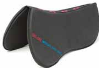
NEW ZILCO WEIGHTED GEL PADS 4KG & 10KG