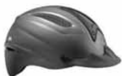
NEW XT ENDURANCE HELMET