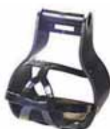
FLEX RIDE CAGE STIRRUPS IMPORT SCOTLAND