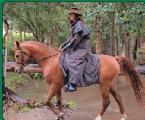
Purebred Arabian Gelding Falcon Khalif

The best rain gear an endurance horse & rider can wear!