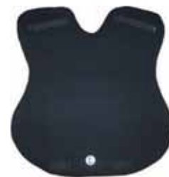
WEIGHTED GEL PAD AVAILABLE IN 4KG, 6KG, 8KG, 10KG & 12KG Smaller Weights Coming Soon