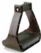
EZ RIDE NYLON STIRRUP