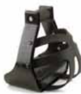
EZ RIDE NYLON CAGED STIRRUP