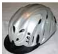
LAS HELMET. COLOURS: SILVER & RED