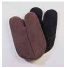
NEW SUEDE SEAT SAVER IMPORTED UK