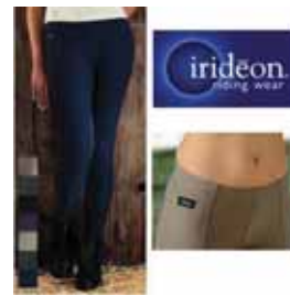
IRIDEON ESSENTIAL TIGHTS REG OR LOW RISE