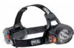
NEW ULTRA PETZL HEADLAMP