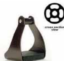
EZ RIDE STIRRUPS SHOCK ABSORBANT TOP BAR