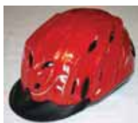
TROXEL SIERRA HELMET