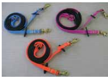
NEW ZILCO FLURO RANGE. Colours - Orange, Cerise Pink & Cyan Blue. available in the Deluxe Breastplate, Deluxe Endurance Reins, Marathon Bridle & Rings