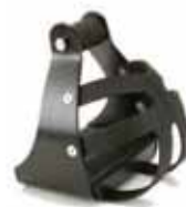
EZ RIDE ALUMINIUM CAGED STIRRUP