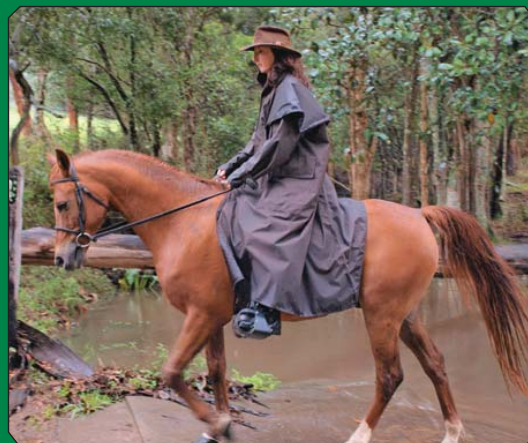
Purebred Arabian Gelding Falzon Khalif