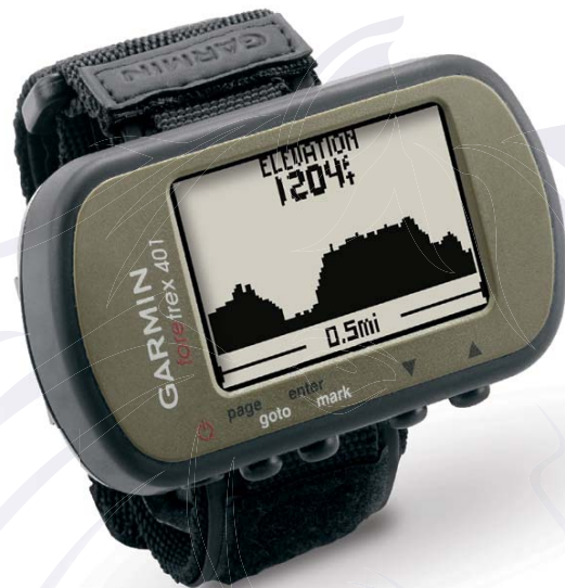
Garmin Foretrex 401