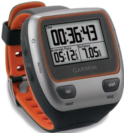
Garmin 310 XT