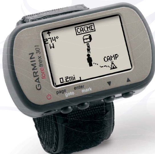
Garmin Foretrex 301