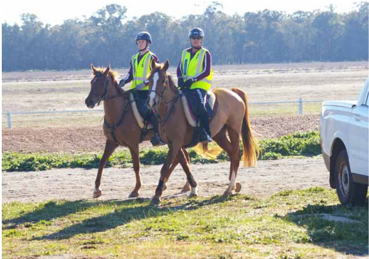
Coolamon