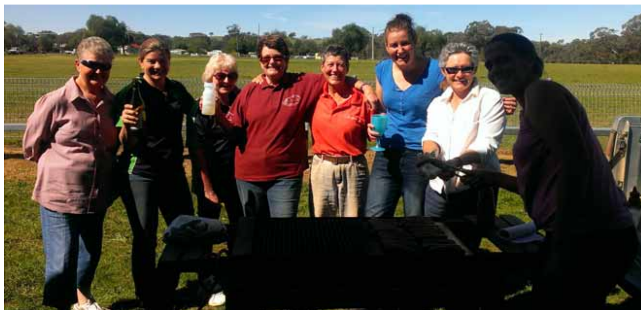
Photo of the 'woman power' committee of Woodstock (Lachlan Club).....the men still do lots behind the scenes but know better than to interfere with organising matters!