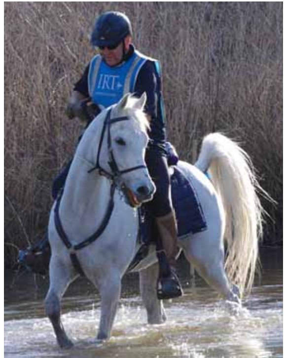
Animal Focus Photo