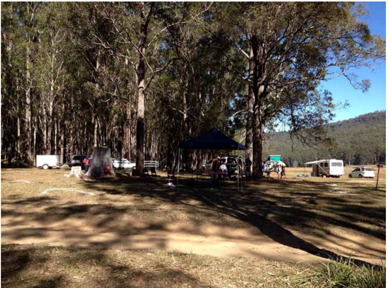
Ride base at Upper Corindi - all quiet in the vetting area