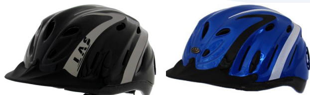
New Las Helmet colours

World Class Endurance Tack & Equestrian Clothing