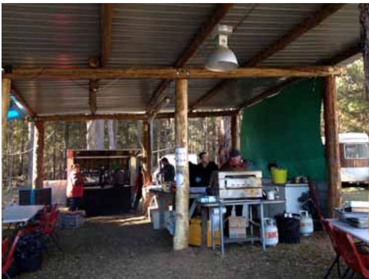
The canteen at Upper Corindi - Hardwood Cafe