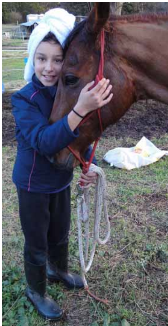
Ears with a young admirer and strapper. Potential 400 k rider of the future?