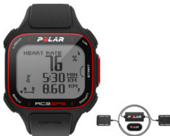
The new Polar Equine RC3 on board HRM with GPS.