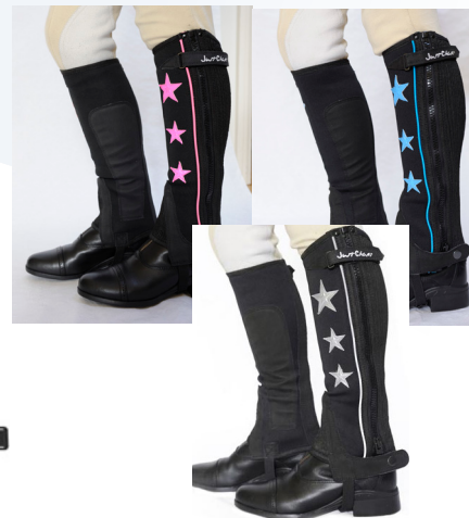
Just Chaps neoprene half chap with reflective stars