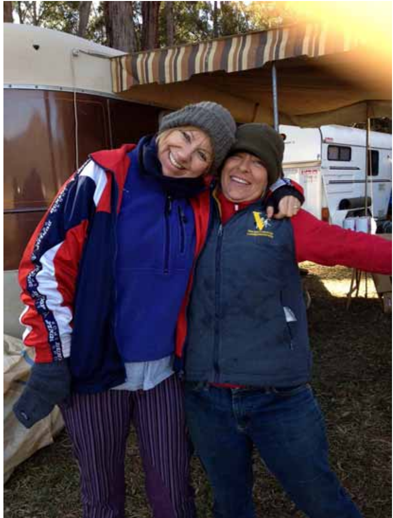
Did we mention it was a bit chilly in the morning