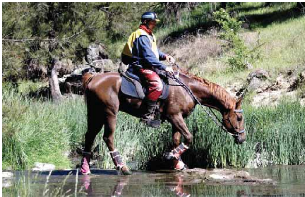
Photo from Scenic City ride