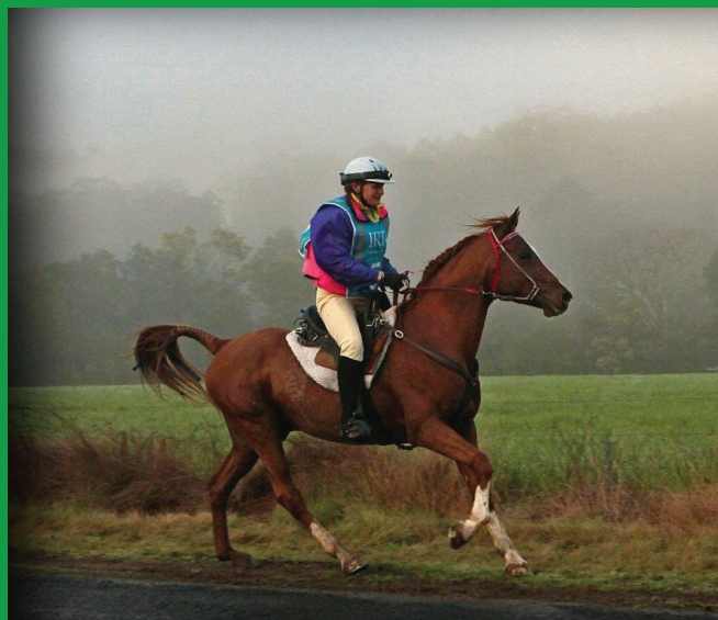
Girilambone Orian 15 .1h

Full brothers—Sire: Chip Chase Sadaqa Dam: Belimba Park Simonette Progeny competing successfully in Australia & the UAE