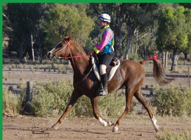
Girilambone Seedy Bub