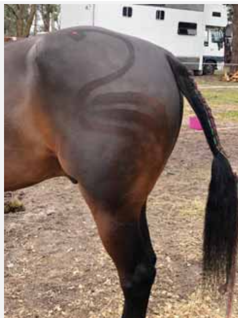
Beautifully presented Warrawee Gay Paree. Note the artistic clipping.