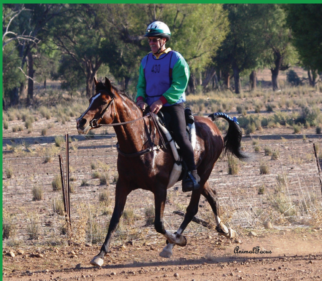
Girilambone Comet 15.3h