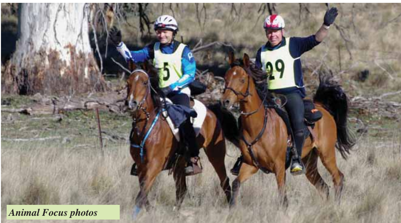
Animal Focus photos