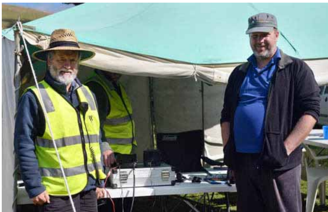
Wonderful WICEN manning the radios!