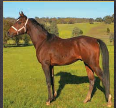
WYNLEE MARAKI (Prince Benay x Wynlee Karina)