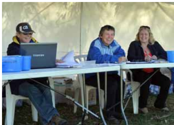
Our fantastic vets, TPRs and office people – thank you!