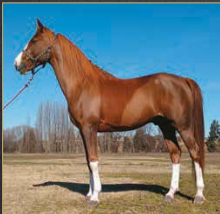
Proven Endurance Stallion LITTLEBANKS CRYSTAL WINGS (Chip Chase Sadaqa x Hillbrook Flite)