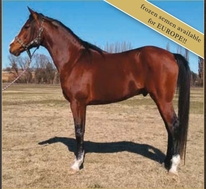
LITTLEBANKS TROUBADOUR (Chip Chase Sadaqa x Hillbrook Desert Silver)