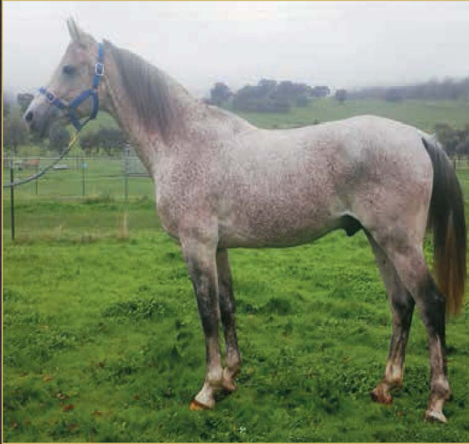
SUNCREST SADAQA'S PRIDE (Chip Chase Sadaqa x Ghabra)

Proven endurance stallion and sire of proven endurance progeny in Australia and worldwide SUNCREST SADAQA'S PRIDE and LITTLEBANKS TROUBADOUR will be standing at Al Jeda Arabians for the 2015/16 breeding season via A.I. and natural service (to approved mares).